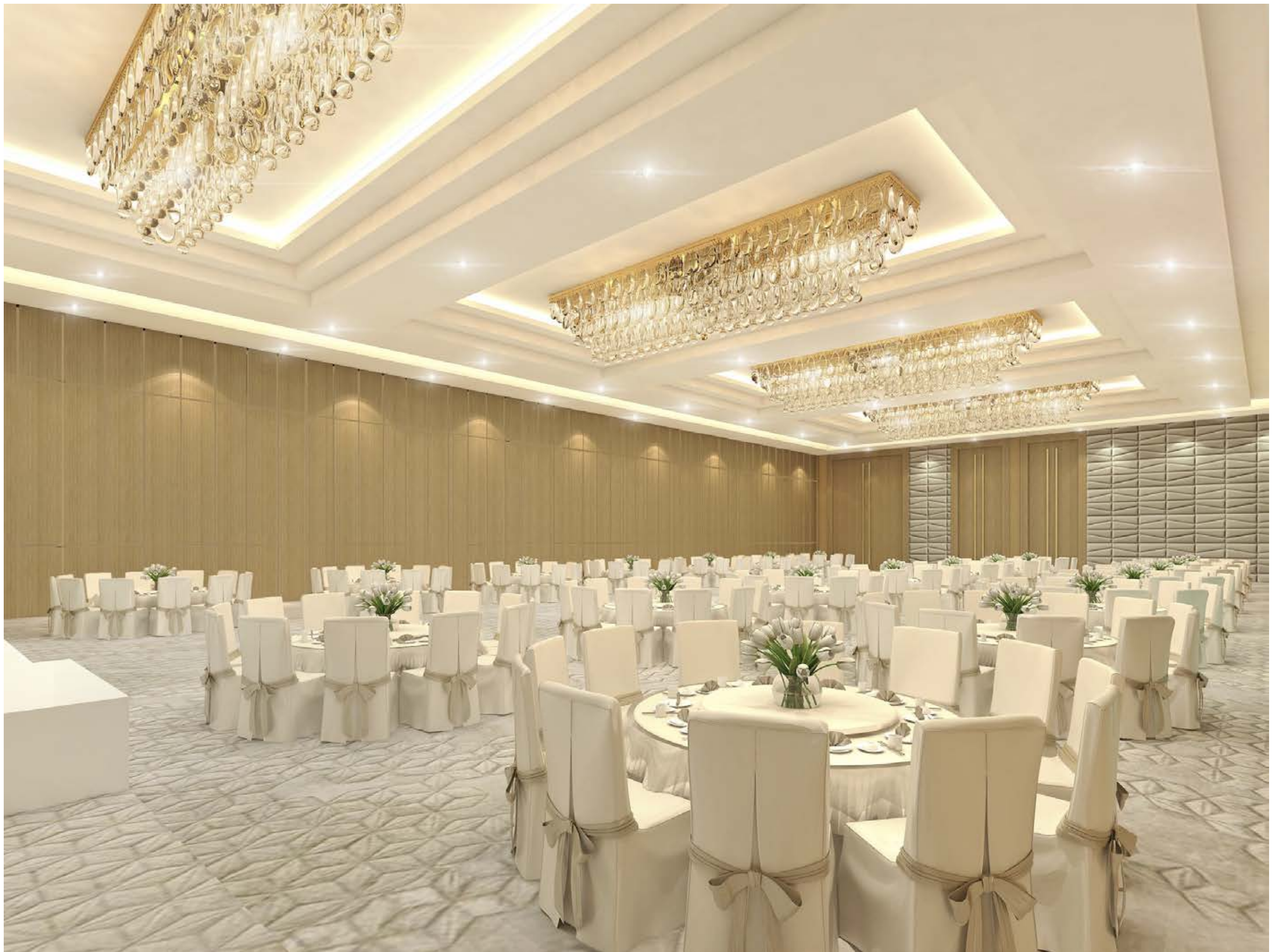
WEDDING BALLROOM AT RASHIDIYA PALACE AJMAN FIT OUT WORK