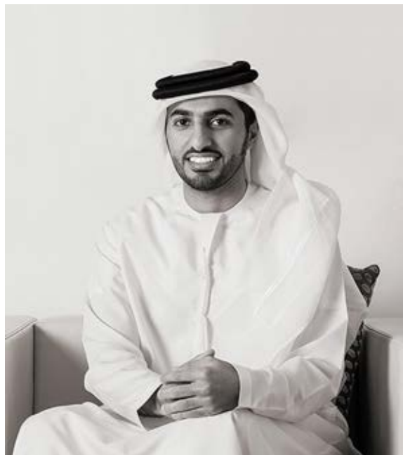
His Highness Sheikh Rashid bin Humaid Al Nuaimi